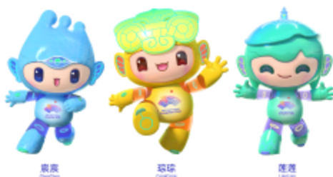
杭州2022年第19届亚运会吉祥物 The Mascots of The 19th Asian Games Hangzhou 2022