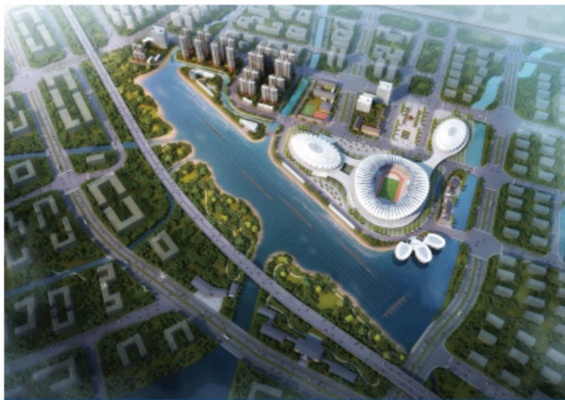
Wenzhou Dragon Boat Centre