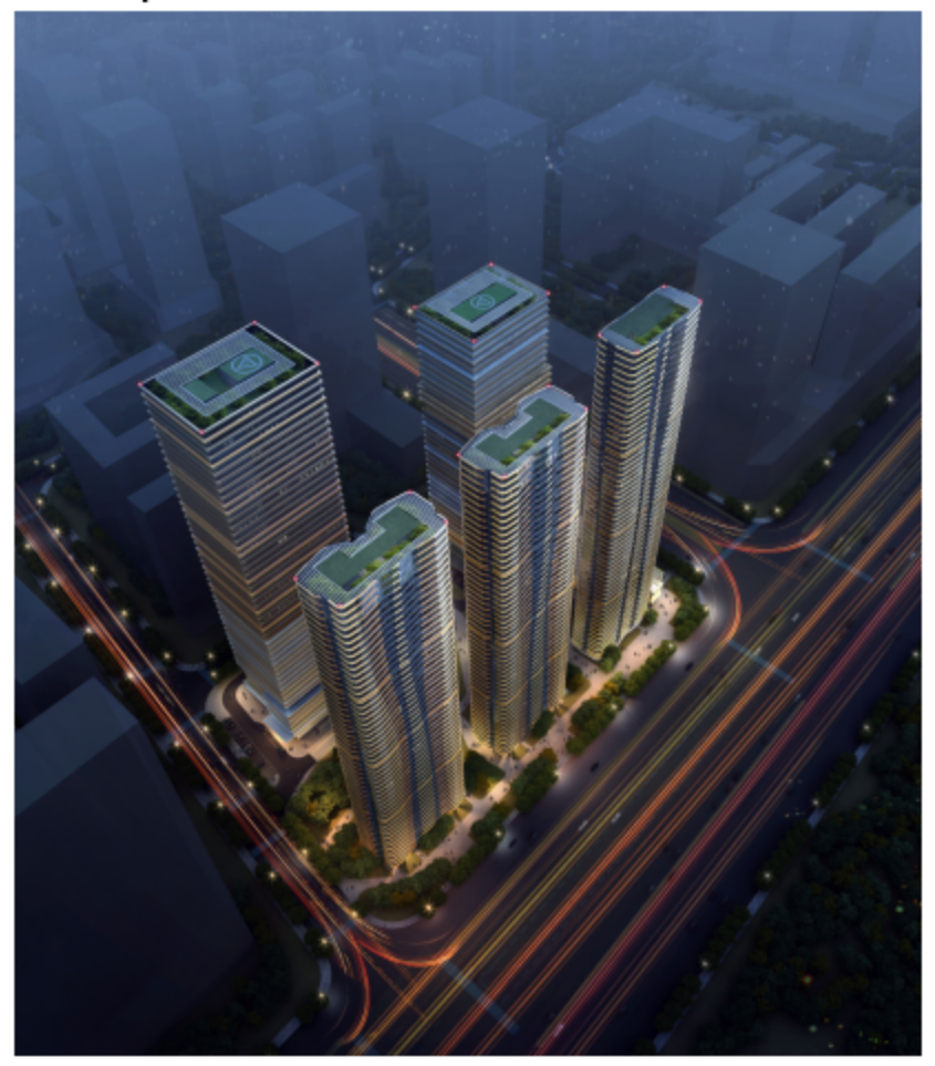
Hangzhou Qi-yuan (Zhili) Chess Hall