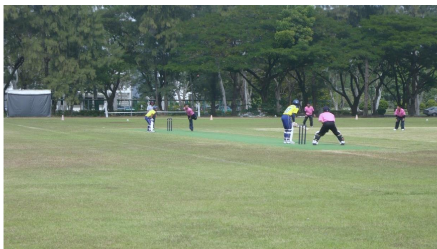
Venue2: Asian Institute of Technology Cricket ground