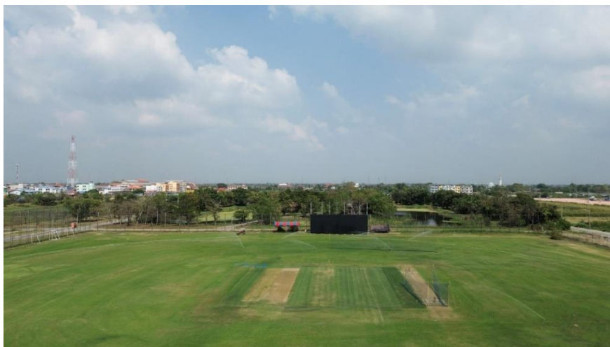
Venue 1: Terdthai Cricket Ground