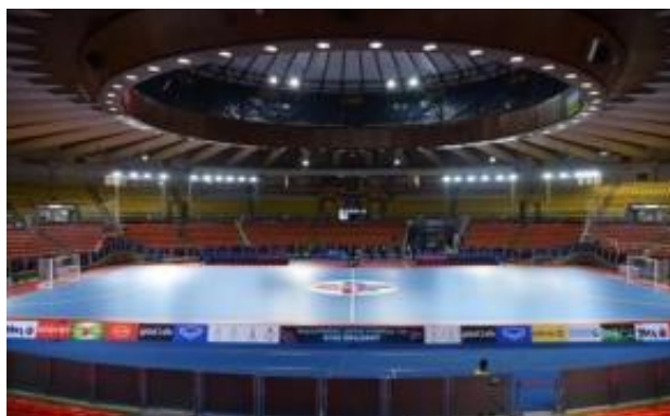
Indoor Stadium Huamar

All pitches shall have identical dimensions length for 40m and width of 20m. Official Flooring for the Competition will be WOOD.